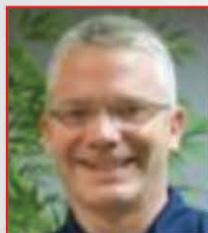
Mark Lyons Toyota