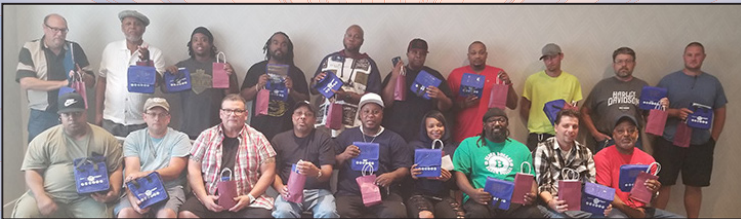
JOHN DEERE SHARED SERVICES - JOLIET, IL

A huge THANK YOU goes out to all CPC Logistics, Inc. drivers across the country for your hard work and commitment to safety. We appreciate your dedication and professionalism as you get the job done for our customers each day.