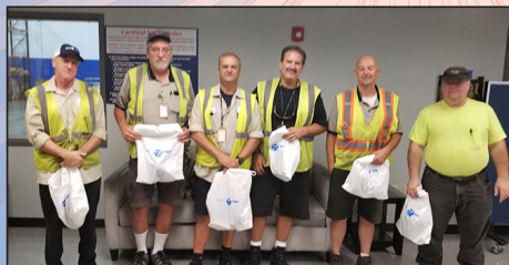
BENJAMIN MOORE & COMPANY CAROL STREAM, IL