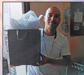
WALGREEN COMPANY BRADENTON, FL